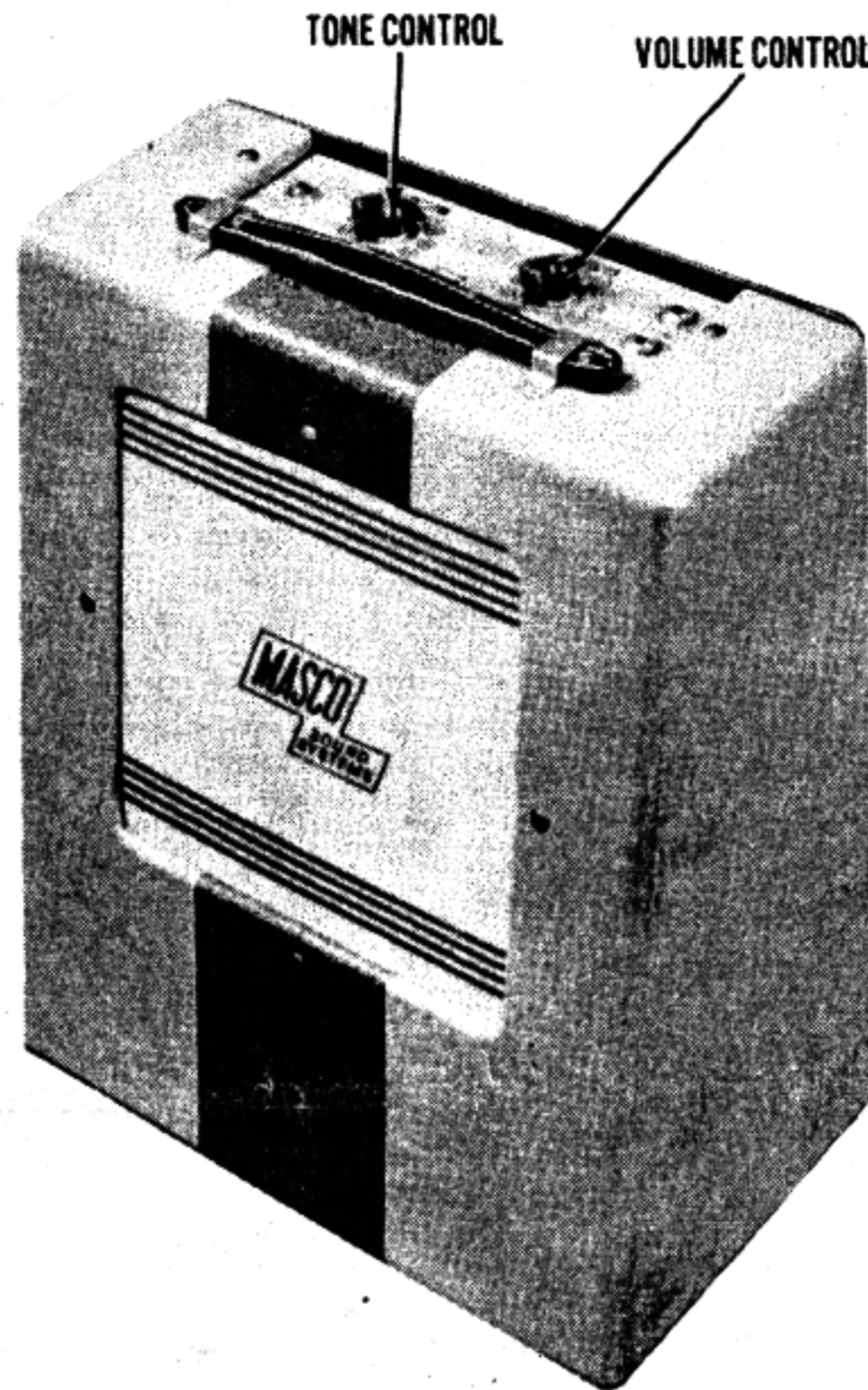
MASCO MODEL MAP-120N